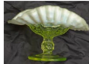
OPALESCENT COINSPOT COMPORT