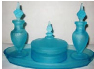
TIFFIN MILADY TWISTED OPTIC VANITY/DRESSER SET