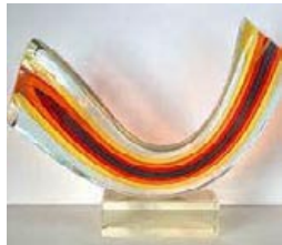
LITTLETON "RUBY ORANGE MOBILE ARC"

Once again we'll have two days and three nights of food, fun and fellowship. We have a wonderfully diversified panel of speakers this year, giving us the opportunity to learn about the glass of many eras from some of the country's best speakers on antique and collectible glass: