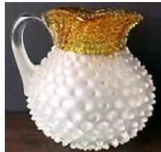
FRANCES WARE AMBER-STAINED PITCHER