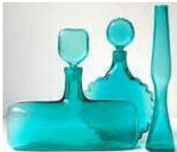
HUSTED-DESIGNED BLENKO PIECES