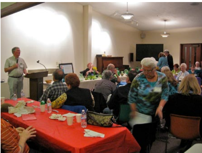
March Meeting after Clam Chowder Dinner